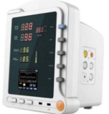
THREE PARA PT MONITOR-CMS