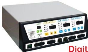
Digital 250/300/400 watt

FEATURES : CUT , COAGULATE , BIPOLAR MODE, UNDER WATER CUTTING