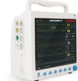
FIVE PARA PT MONITOR-CMS