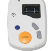
ECG HOLTER - CMS TLC 6000