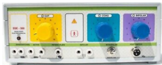
Analog : 250/300/400 watt

FEATURES : CUT , COAGULATE , BIPOLAR MODE, UNDER WATER CUTTING