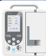
INFUSION PUMP CMS-SP750