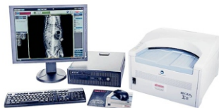
New & Pre-Owned C.R Systems