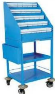
EMERGENCY DRUG TROLLEY