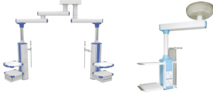
SINGLE & DOUBLE PENDANT