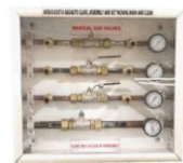
CONTROL PANEL- ZONAL BALL VALVE

Intensity: 2,20,000 lux +/- 10% Number of LEDs :- 19 x 8 ( Multiple Colour ) Size of led field : 12-30cm Adjustable Focus With brightness controller ( FEATHER TOUCH )