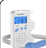
FETAL DOPPLER VCOMIN-200