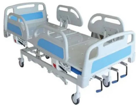
FOUR FUNCTIONAL MANUAL ICU BED