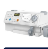
SYRINGE PUMP BYZ - 810