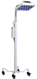
LED Warmer Light