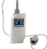
PULSE OXIMETER -AM - NT 1 B