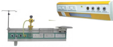
BED HEAD PANEL