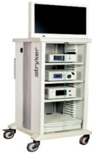
Endoscopy & Laparoscopy Camera Units