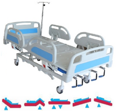
FIVE FUNCTION ICU MANUAL BED