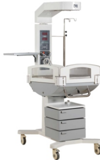
Controlled Radiant Warmer