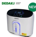
HOM. OXYGEN CONCENTRATOR