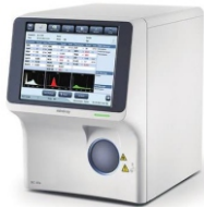
CELL COUNTER - MINDRAY

FEATURES : CAUTERY WITH VESSEL SEALER + SALINE SYSTEM +7 SEGMENT