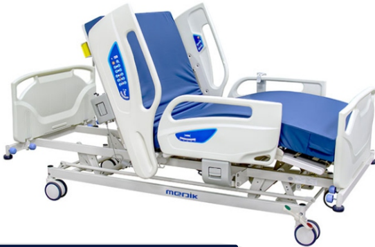
FIVE FUNCTION ICU ELECTRIC BED