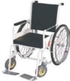
WHEEL CHAIR - FOLDING & FIXED TYPE