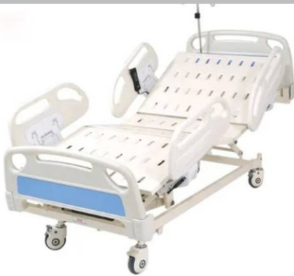
FOUR FUNCTIONAL ELECTRIC ICU BED

2240 mm L x 1080 mm W x Height adjustable from 535 mm to 890 mm