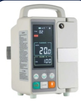
INFUSION PUMP AM - 820