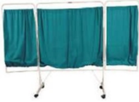
BED SIDE SCREEN