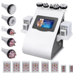
Lipo Cavitation Machine