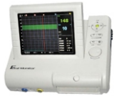
FETAL MONITOR CMS-800G