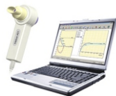
PFT MACHINE 401