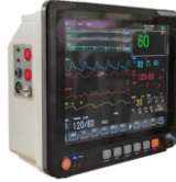
FIVE PARA PT MONITOR-5000B