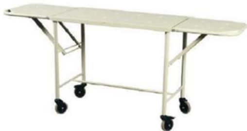
TABLE TOP STRETCHER & FOLDEBAL STRETCHER