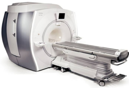
New & Pre-Owned C.T Scan Machines