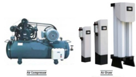
COMPRESSOR - DRYER