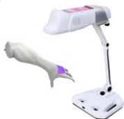
INFRARED VEIN FINDER