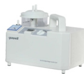
PORTABLE SUCTION MACHINE