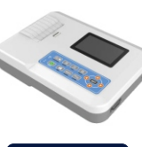
3 CHANNEL ECG CMS-300G