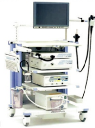
New & Pre-Owned Gastroscopy Units