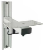
MONITOR STAND WALL MOUNT