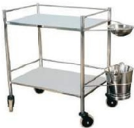
DRESSING TROLLEY WITH BOWL & BUKET