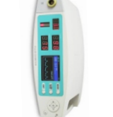
TABLE TOP PULSE OXY-CMS 70A