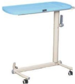
FOOD TABLE : HEIGHT ADJUSTABLE