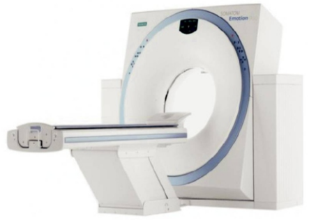
New & Pre-Owned M.R.I Scan Machines