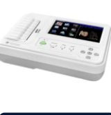
6 CHANNEL ECG CMS-300G