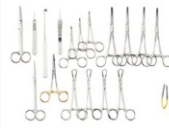
T.C & GENERAL INSTRUMENTS