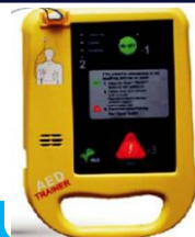
AM-AED 7000- ECG