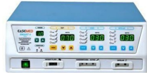
Digital : Cautery + Saline

FEATURES : CUT , COAGULATE , BIPOLAR MODE, UNDER WATER CUTTING