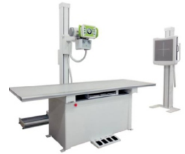
New & Pre-Owned C.T Scan Machines