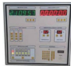
Operation Theatre Control panel