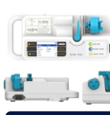
SYRINGE PUMP CMS- SP 950