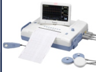
FETAL MONITOR BISTOS-350