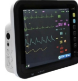
FIVE PARA PT MONITOR-YK