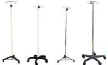
SALINE STAND REGULAR - STANDARD - PREMIUM