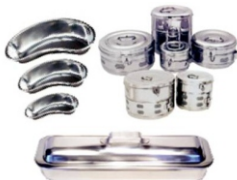
KIDNEY - INSTRUMENT TRAY & DRUM