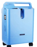
MED. OXYGEN CONCENTRATOR