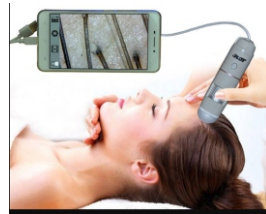
SCALP & SKIN ANALYZER