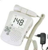
FETAL DOPPLER VCOMIN-300