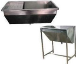
OT SCRUB SINK