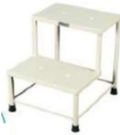
STEP STOOL : SINGLE & DOUBLE