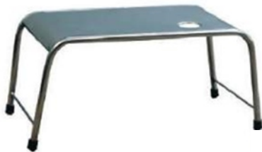
OVER BED TABLE