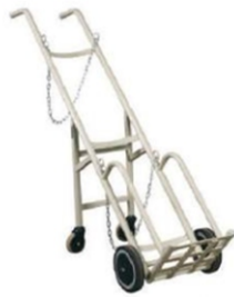
JUMBO OXYGEN TROLLEY