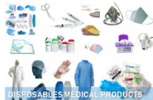
SURGICAL DISPOSAL MATERIALS