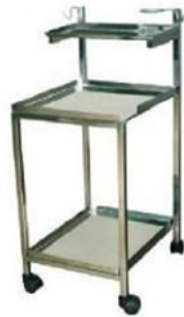
ECG MACHINE TROLLEY