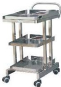
BED SIDE DRUG TROLLEY