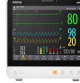
FIVE PARA MINDRAY