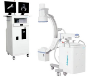
New & Pre-Owned C-arm Machines