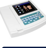
12 CHANNEL ECG CMS-300G