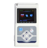
ECG HOLTER - CMS TLC 5000