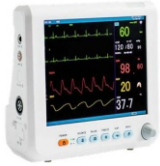
FIVE PARA PT MONITOR-20A