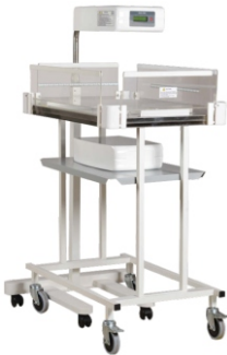
Power LED Photo therapy