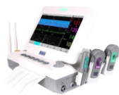
FETAL MONITOR OXFORD -500