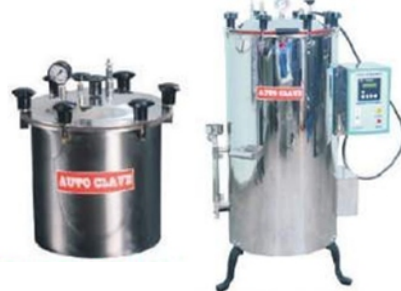
AUTOCLAVE ( SINGLE & DOUBLE DRUMS )