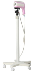
Digital Video Colposcope