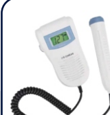
FETAL DOPPLER BT-200