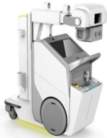
ADVANCED X RAY