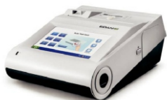
Arterial Blood Gas Machine