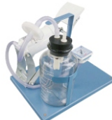
PEDAL SUCTION MACHINE